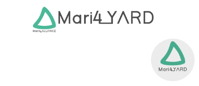
Figure 1. Proposal 1 – visual identity developed during the proposal drafting

The visual identity is the first key aspect for a clear, attractive, coherent and effective communication structure. The Mari4_YARD visual identity was initially developed during the proposal drafting; once funded it was renewed in order to reinforce the concepts of construction, shipyard, connection, technology, Internet of things. Based on this concept, a new identity proposal was developed, with two colour palettes. The two proposals (the one developed during the proposal drafting and the new one with the two different colours) are shown in Figure 1-Figure 2. Version 2 of Proposal 2 (see Figure 2) was by far the most voted within the Mari4_YARD Consortium.